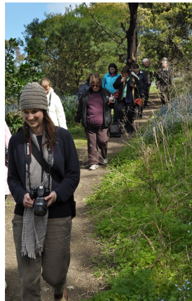
Camera Club members enjoying a photo opportunity at Tower Hill

Field trips allow us to venture out to new places and capture images not normally seen.